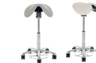
Lite Hybrid Art no 600- Lite Advanced Hybrid 601-

The Lite saddle stool has an ergonomic design that promotes the spine's natural 'S' shape, as well as an ideal active sitting position. A small, soft stool with a narrow seat, gives users a more compact posture. Suitable for use with backrest Mini or Core+