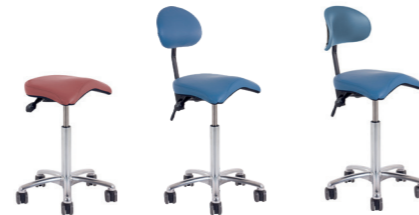
Statera Taburett Art no 102-

The Statera features a mix of conventional seating and saddle seating. A very comfortable seat with the best out of two worlds. The Statera is available as a Taburett without backrest or with the choice of the two backrests Oval and Core+