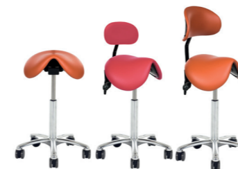
Lite Art no 202- Lite Mini 304- Lite Core+ 311-

The Classic, is a soft, comfortable stool with a wide seat. Levers to adjust height and tilt are located just under the seat. Suitable for use with backrest Mini or Core+