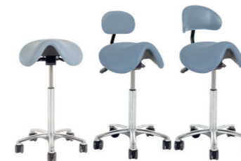
Classic Art no 200- Classic Mini 302- Classic Core+ 309-