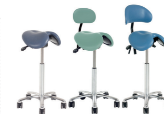
Lite Advanced Art no 203- Lite Advanced Mini 305- Lite Advanced Core+ 312-

The Classic Advanced, has the same comfortable wide seat as the Classic, but features additional zones and specially developed indentations that provide additional comfort for men. Suitable for use with backrest Mini or Core+