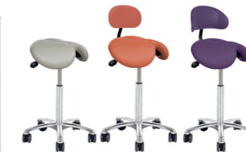
Classic Advanced Art no 201- Classic Advanced Mini 303- Classic Advanced Core+ 310-